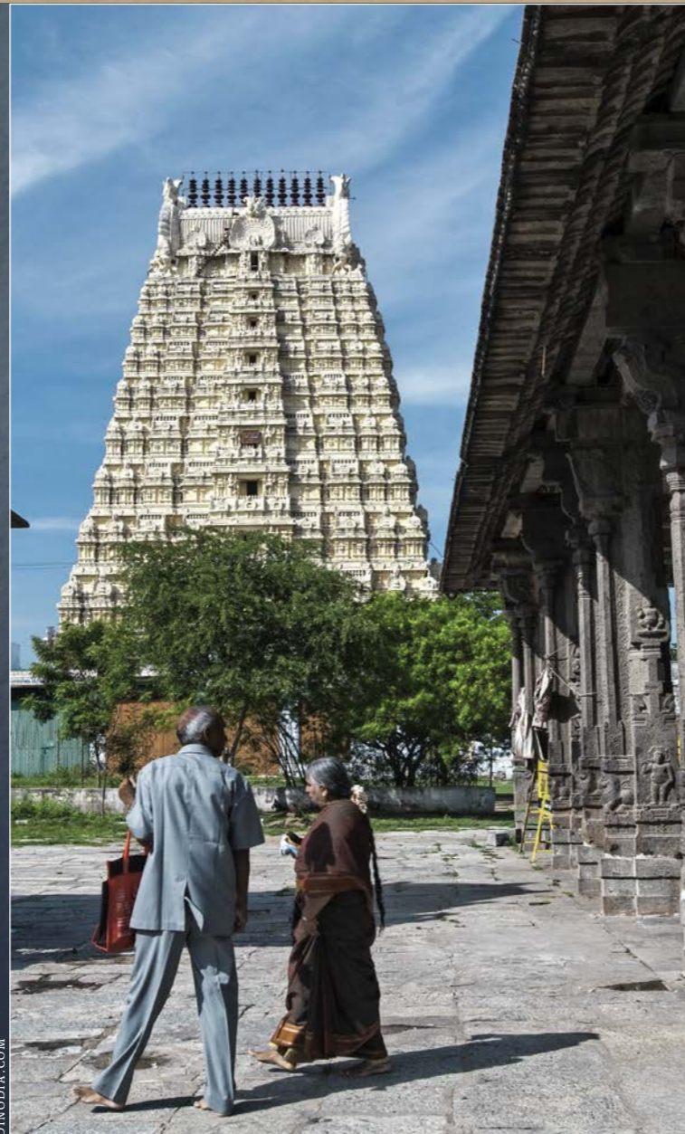
A couple walk barefoot in the precincts of the Sri Ekambaranathar Siva temple in Kanchipuram, Tamil Nadu

him, helping and guiding his entire evolutionary pattern. Darshan coming from the great temples of our Gods can change the patterns of karma dating back many past lives, clearing and clarifying conditions that were created hundreds of years ago and are but seeds now, waiting to manifest in the future. Through the grace of the Gods, those seeds can be removed if the manifestation in the future would not enhance the evolution of the soul.