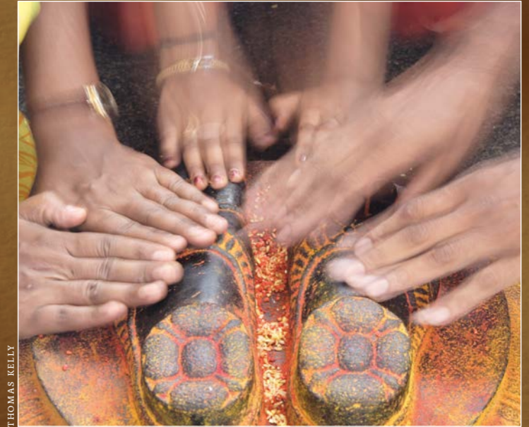
Seeking blessings, pilgrims reverently touch the sculpted stone feet of Lord Vishnu in Tirumala Temple's Srivari Padalu shrine

The Gods of Hinduism create, preserve and protect mankind. Their overview spans time itself, and yet their detailed focus upon the complicated fabric of human affairs is just as awesome. It is through their sanction that all things continue, and through their will that they cease. It is through their grace that all good things happen, and all things that happen are for the good. Now, you may wonder why one would put himself under this divine authority so willingly, thus losing his semblance of freedom. But does one not willingly put himself in total harmony with those whom he loves? Of course he does. And loving these great souls comes so naturally. Their timeless wisdom, their vast