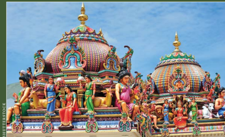
Denizens of the three worlds are often depicted, as here, on a temple's ornate towers

The reality of the Mahadevas and their darshan can be experienced by the devotee through his awakened ajna