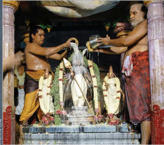
Priests bathe the five-metal parade murti of Lord Shanmukha at the Tirupparankunram Temple near Madurai in Tamil Nadu

Chanting and satsanga and ceremonial rituals all contribute to this sanctifying process, creating an atmosphere to which the Gods are drawn and in which they can manifest. By the word manifest , I mean they actually come and dwell there and can stay for periods of time, providing the vibration is kept pure and undisturbed. The altar takes on a certain power. In our religion there are altars in temples all over the world inhabited by the