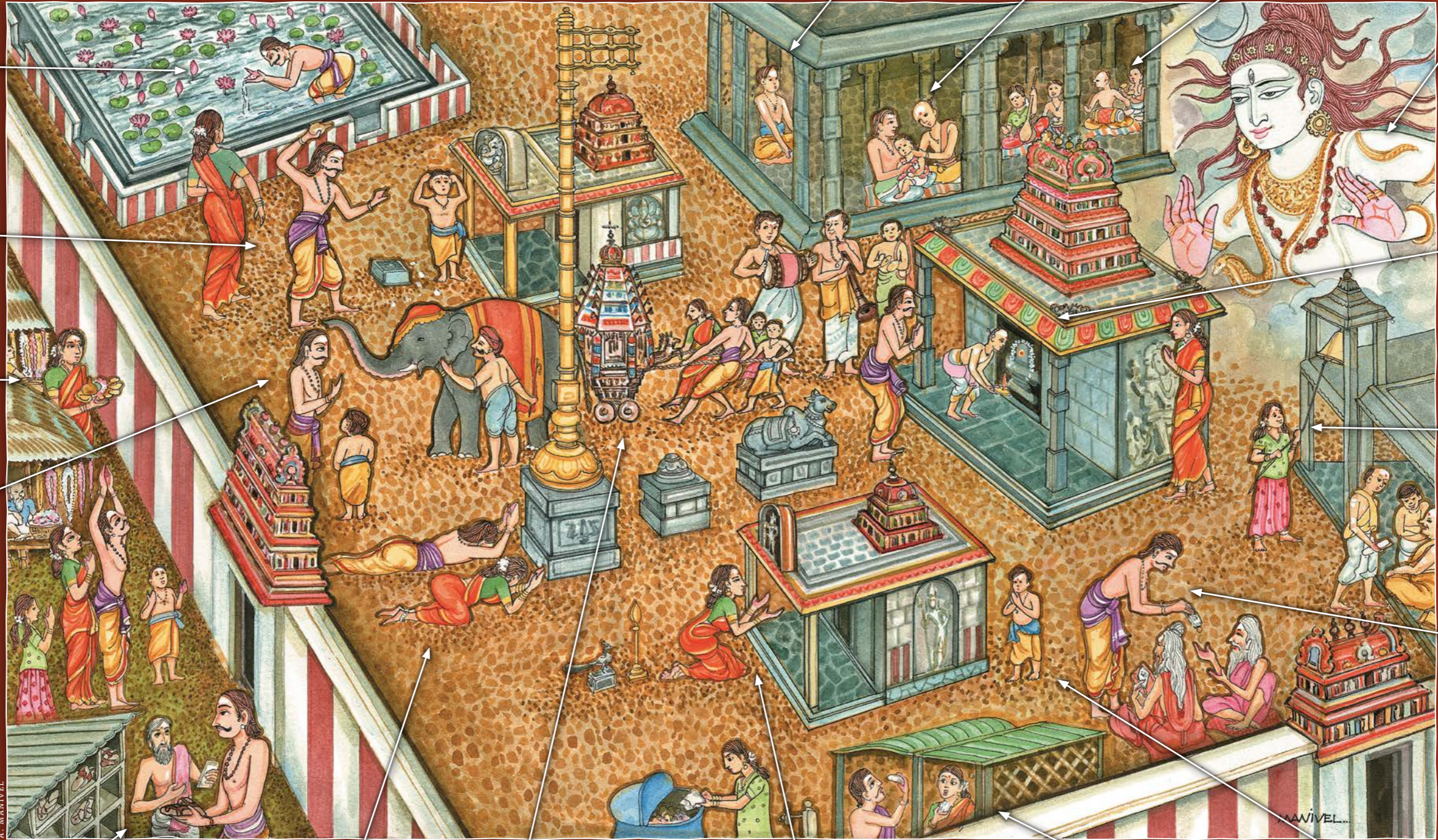
A man bathes and worships at the temple tank as an act of purification.

This mural depicts typical activities in the courtyard of a large temple such as one would find in South India.